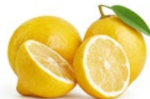
LEMON Femminello, Monachello, Zagara bianca, Interdonato