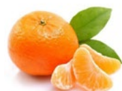
MANDARIN Avana, Tardivo di Ciaculli