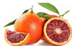
BLOOD ORANGE Tarocco, Moro, Sanguinello, Sanguigno