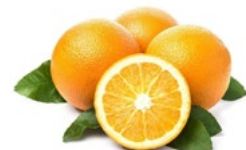
BLOND ORANGE Navel, Valencia, Biondo comune