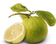
BERGAMOT Femminello, Castagnaro, Fantastico